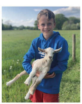
Will would like someone who is good with children, includes children in the services and likes football.