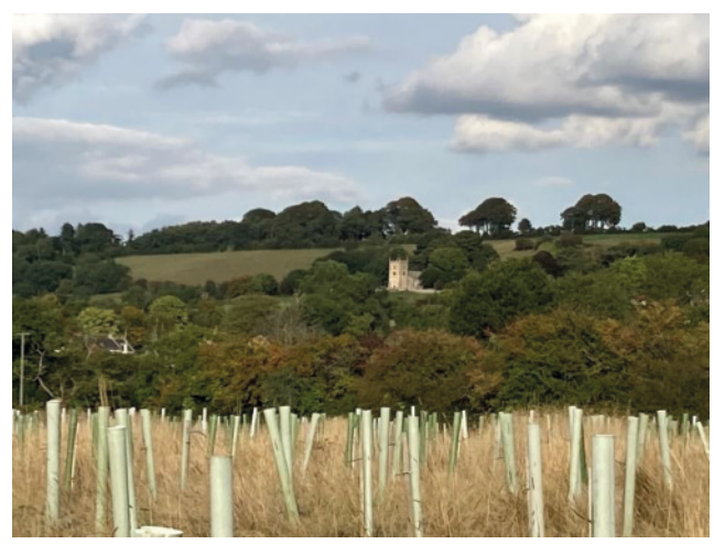
Community wood with Old Sodbury church in the background.

We also walked through the new community woodland and orchard in which several of those present had planted trees. Hopefully in a couple of years we can sample some produce.